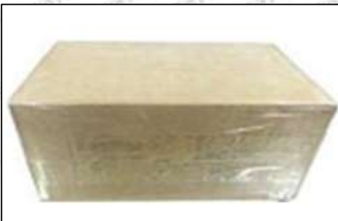
Pic No. 2

Domestic express packaging: Wrapped with Transparent tape